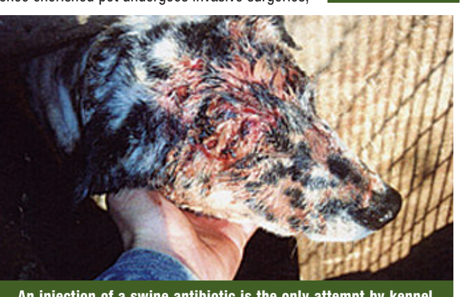
An injection of a swine antibiotic is the only attempt by kennel workers to treat the infected bite wounds on this dog's head. The dog eventually dies.