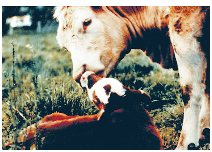
Mmm. Paradoxical burgers for lunch anyone?

Get it or not, the powerful meat and dairy industries are inside the schools, government and media with milk mustaches and smiling cows, to assure us that yes, we ought to rampage against the puppy-killers but no, we need not mourn our meals.