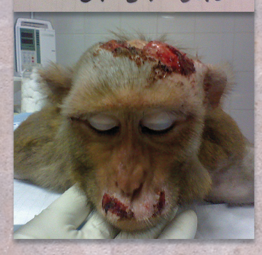
IT'S NOT SCIENCE IT'S VIOLENCE TIME TO END IT