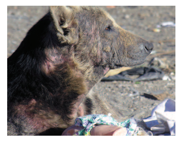
Mange is rampant in impoverished quake affected areas. In Villa Futura we saw an estimated 500 animals living across a wide field used as a trash dump.