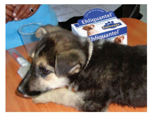
Villa Futura: We treat animals in vacant buildings, but without funds to create a temp shelter, officials may order a mass animal kill for human health concerns.