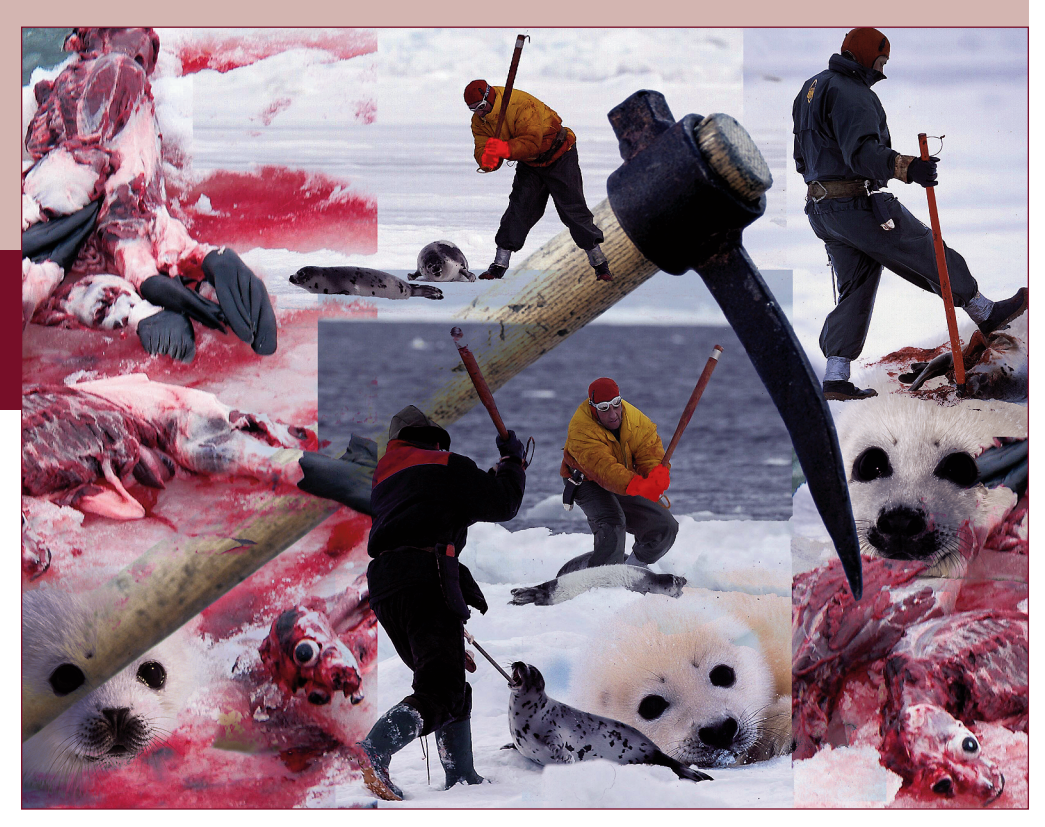
PHOTO COLLAGE, poster-size original created by Kinship Circle. CREDITS: Sea Shepherd Conservation Society; IFAW, yellow jacket sealer clubbing; IFAW, rolling over seal; Reio Hara & IFAW, harp whitecoat babies. www.harpseals.org/toolbox/xtoolbox1.html#kill

Men bludgeoning fuzzy-wuzzies? In Canada the harp seal is no cute critter. He is the official scapegoat for a depressed fishing industry.